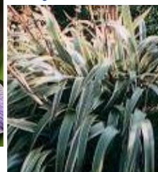
Phormium cookianum variegatum